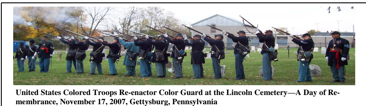
United States Colored Troops Re-enactor Color Guard at the Lincoln Cemetery—A Day of Remembrance, November 17, 2007, Gettysburg, Pennsylvania

The Communication Committee is composed of a matrix of individuals and dedicated units of our Association working harmoniously to communicate with the public. The matrix includes a Website, See COMMITTEE , page 6